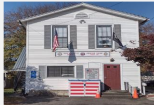
Joseph W. Tarrant Jr. American Legion Post 100