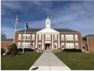
Clifford J. Hurgin Municipal Center