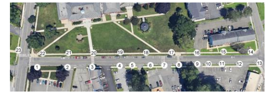
Map showing the approximate banner locations on School Street.

The application can be downloaded from our website www.bethelhometownheroes.org or by stopping in at the First Selectman's Office at the Bethel Town Hall. Applications require the filled out form, a photograph copy of the hero preferably in military uniform, proof of honorable discharge, photo release acknowledgement and a check for $140 or $200, which will cover the printing and installation costs. Even if you were not honoring a veteran, donations to support this effort would be welcomed to help offset costs.