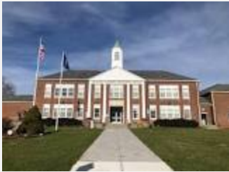
Clifford J. Hurgin Municipal Center