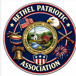
Bethel Patriotic Association